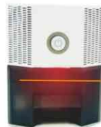
Water tank light turns to red and unit auto shut-off.