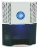
Water tank lights up blue in dehumidification.